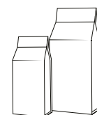
Pack size: 400g - 1,5kg